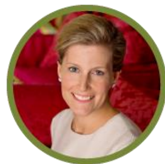
HRH the Countess of Wessex

It was a delight to hear from three outstanding guest speakers.