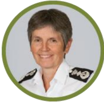
Dame Cressida Dick DBE QPM Commissioner of Metropolitan Police