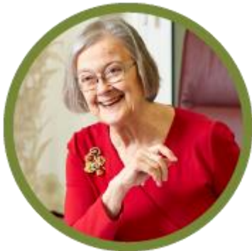
Rt Hon the Baroness Hale of Richmond DBE

All three speakers delivered inspiring, positive and invigorating messages covering strong women and empowerment, the need for more diversity in all areas of public life and the issue of domestic violence. They talked of demonstrating the strength of the female voice, a common endeavour together to improve our society.