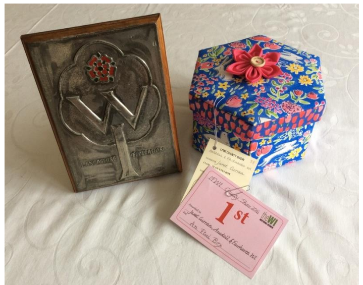
Janet's Etui Box which won "best in show"