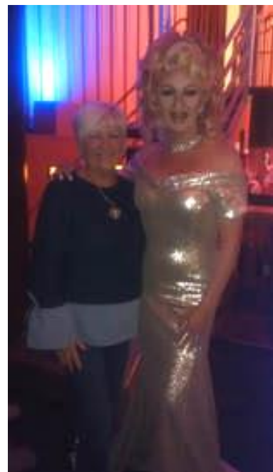
A photo-call for Babs with Zoe!