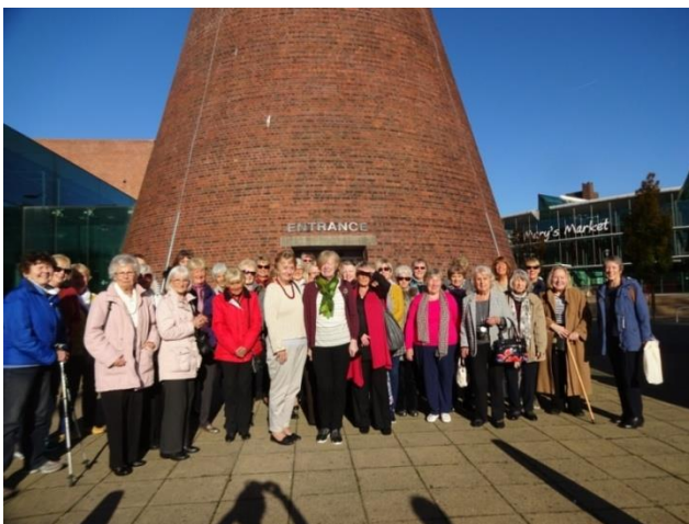
Lined up ready for the action!