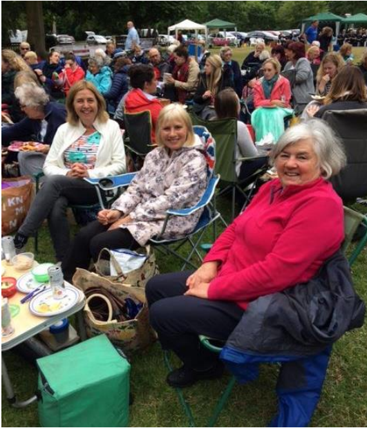
Well prepared for all weathers at outdoor theatre to watch "Little Women"