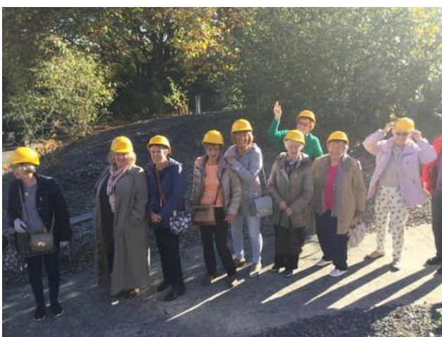
Modelling Hard Hats, not quite Ladies Day at Ascot!