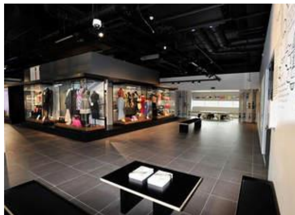
followed by a relaxing wander around Leeds market and shopping centre - the glorious weather made it even more enjoyable.