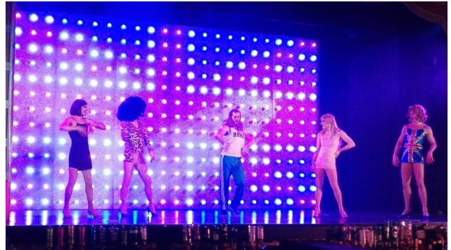
Do these look like the Spice Girls to you?