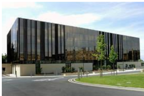
Sandra B says "... a lovely memory of a W.I day out in Leeds last September" A visit to the M&S exhibition