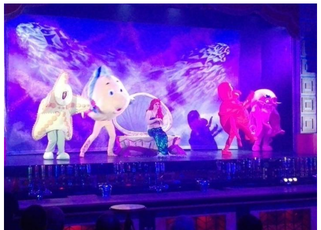
Not a version of the Little Mermaid to take your grandchildren to!