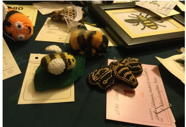
Linda's beaded bee