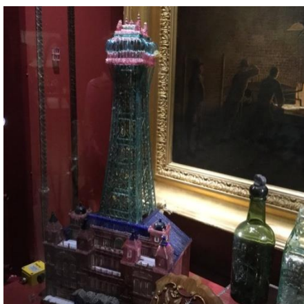
We were surprised to see Blackpool Tower!